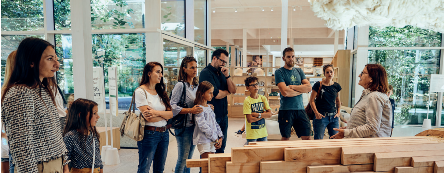
The 'Grüne Erde Welt' was built on an existing commercial site. Small, newly sealed areas were compensated with renaturation of another area.

Industry: Commerce Employees: 498 (FTE) Location: Scharnstein (AT) www.grueneerde.com