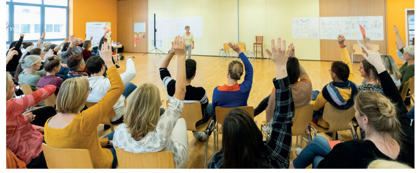
Employees have a stake in success, capital and decisions.

In principle, all employees can self-organize their working hours flexibly and without core hours, taking into account work requirements in coordination with management and direct colleagues. There is no formal procedure for the necessary coordination in the teams; everyone remains in discourse with each other and feels connected. An attempt is made to meet as