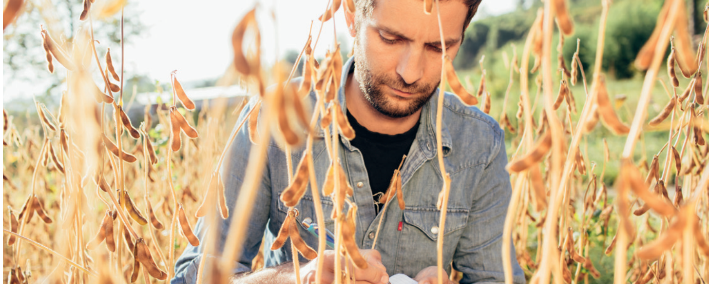
Soybean varieties free from patents for northern cultivation areas.

During the annual 'Soy Round Table', the farmers are also given first-hand insights by the management into what is happening in the most important markets, investments and other challenges.