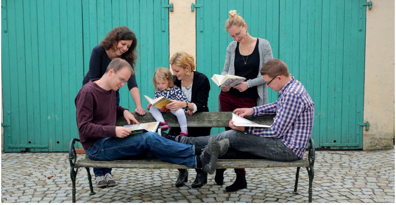
Hobby, work and family time – the buch7 team.

advantage of other funding due to bureaucratic hurdles. Examples of funded projects: Inselhaus – child and youth welfare in Eurasburg – helps children who are disadvantaged and whose development is impaired by family circumstances; foodwatch, which exposes food scandals; in Langweid, the company's headquarters, the old train station was renovated and a non-profit cultural center was founded.