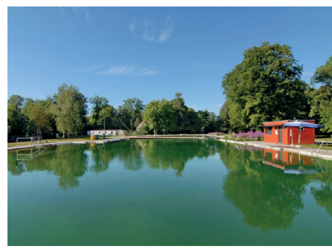
In the Maria-Einsiedel natural swimming pool, the swimming water in the separately constructed regeneration pond is purified in a purely biological and mechanical manner. As clean, soft water, the swimming water flows back into the swimming and children's pond.

company activities in all areas. "At the beginning, we had to ask ourselves the fundamental question, what environmental impact do we have at all, what goes in and what goes out?" With this overview, potential for reduction was identified. From this, management derived the strategic multi-year targets. Each of the 18 facilities of the Münchner Bäder translates these into its own annual measurable individual targets and measures, for example "Determine and reduce shower water per bather," "Analyze electric motors," or "Maintain or reduce bathing water consumption to 35 liters per bather." The continuous updating of the targets as well as the monitoring of the key figures influence decisions on renovations, plant optimization, repairs, but also changes in the operating procedure and organization.