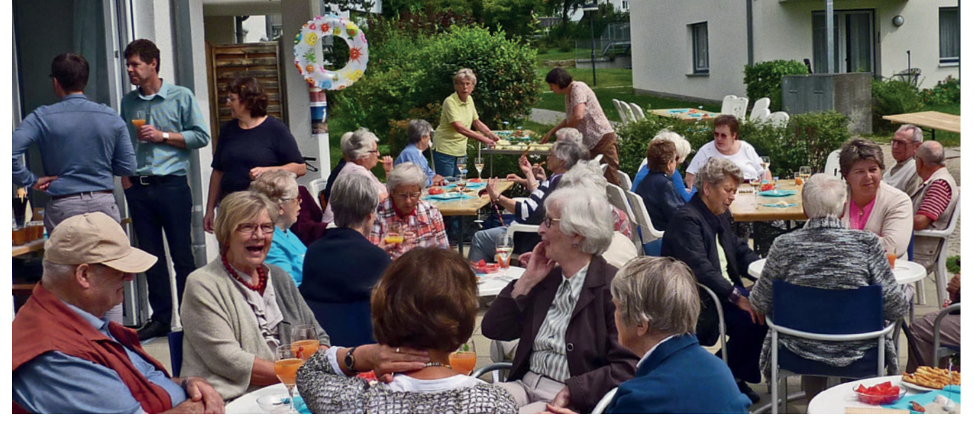
Inclusion in the neighborhood.

Industry: Social economy Employees: 1,867 (FTE) Location: Nurtingen (DE) www.samariterstiftung.de