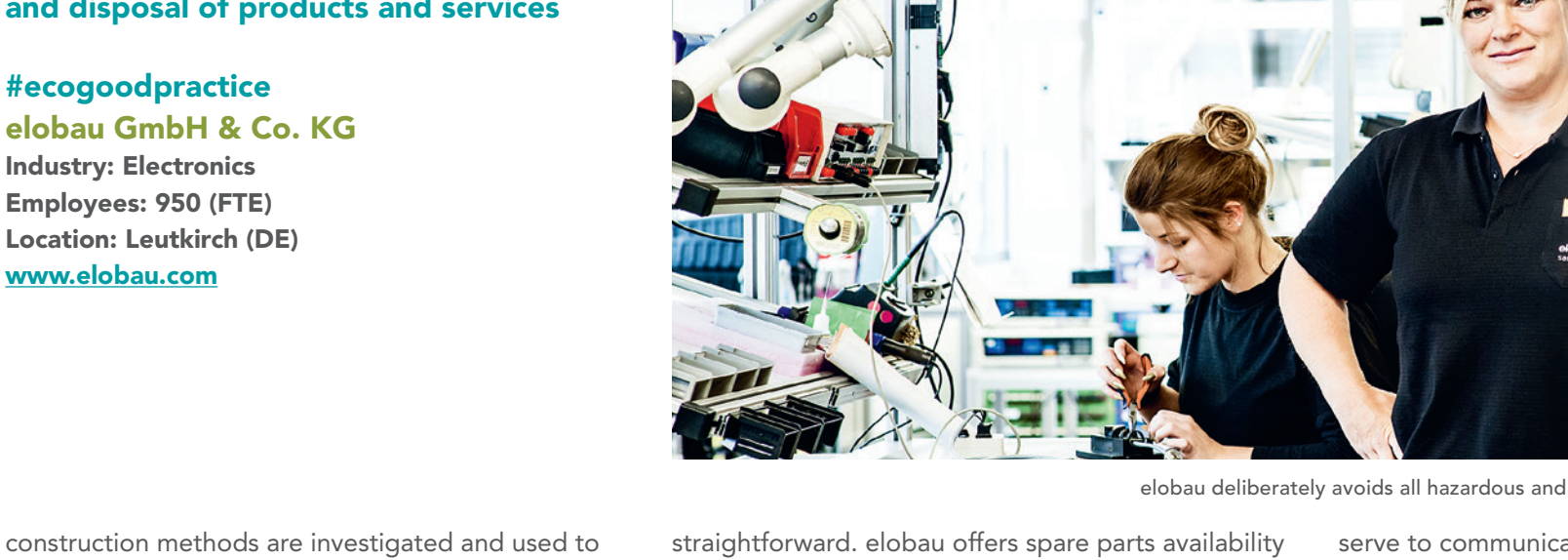
elobau deliberately avoids all hazardous and toxic substances in its products.

improve the ecological sustainability of the products. Environmental influences can be simulated in the in-house test laboratory, thus ensuring the longest possible product life (20,000 operating hours, which corresponds to a service life of about ten years) and thereby reducing harmful environmental effects. elobau deliberately avoids all hazardous and toxic substances in its products and constantly monitors whether other materials are classified as problematic (according to Reach or RoHS).