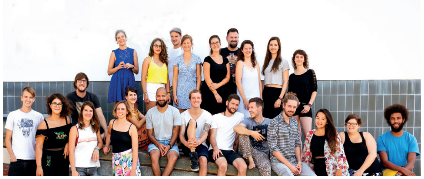
"We want to be able to show ourselves as a whole person, with everything there is, and still take our jobs really seriously and move things forward in a massive way."

Industry: Commerce Employees: 43 (FTE) Location: Berlin (DE) www.soulbottles.de