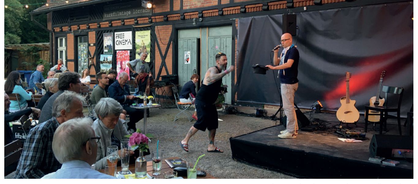
Co-owned socio-cultural meeting place.

Employees: 4,6 (FTE) Location: Lörrach (DE) www.nellie-nashorn.de