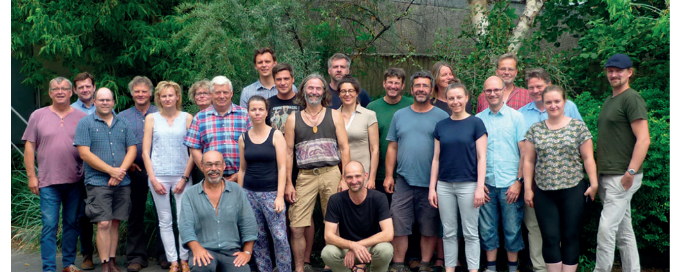
Round Table for Grain, 2019.

Since that pioneering decision in 2009, the farmers have cooperated in setting prices at the Round Table. If one party feels these prices are unworkable, the Round Table is convened and terms are renegotiated. This trust means that even if external factors (e.g. crop failures) affect the pricing equilibrium, all parties at the Round Table can negotiate to find a way forward. This relationship prioritizes binding cooperation; instead of short-term, one-sided profits, there are long-term benefits for all. A vote after each round of negotiations settles whether the agreed terms are fair, and if individual businesses (like Märkisches Landbrot)