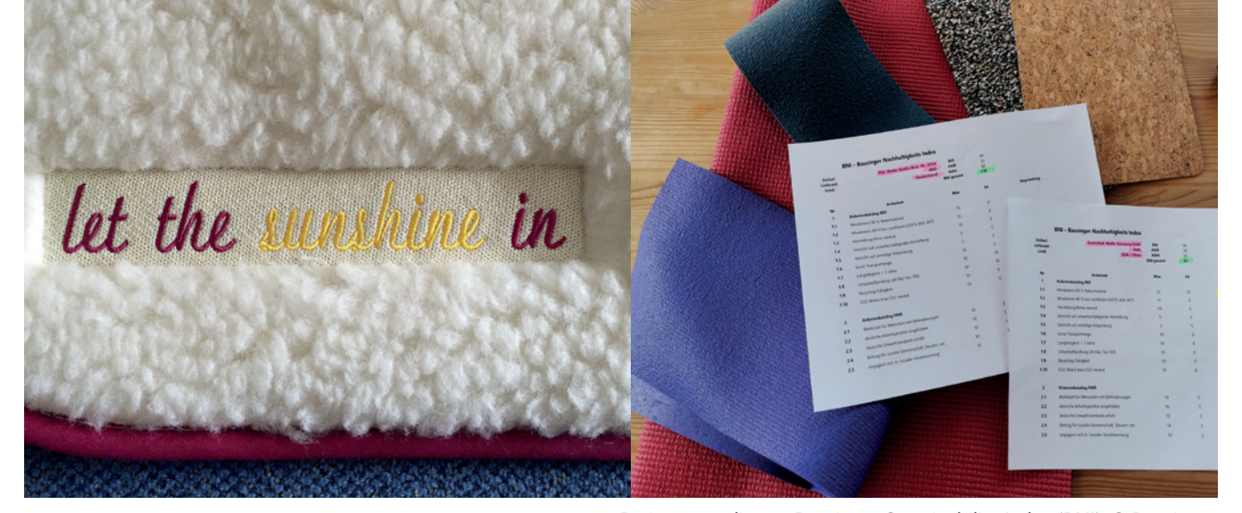
Rating according to Bausinger Sustainability Index (BNI).

Indonesia, with high use of insecticides and pesticides, soil degradation and above-average erosion during monsoon rains. Many plantation workers have health problems due to the sprays used. The vulcanization of rubber produces nitrosamines which are suspected to be carcinogenic.