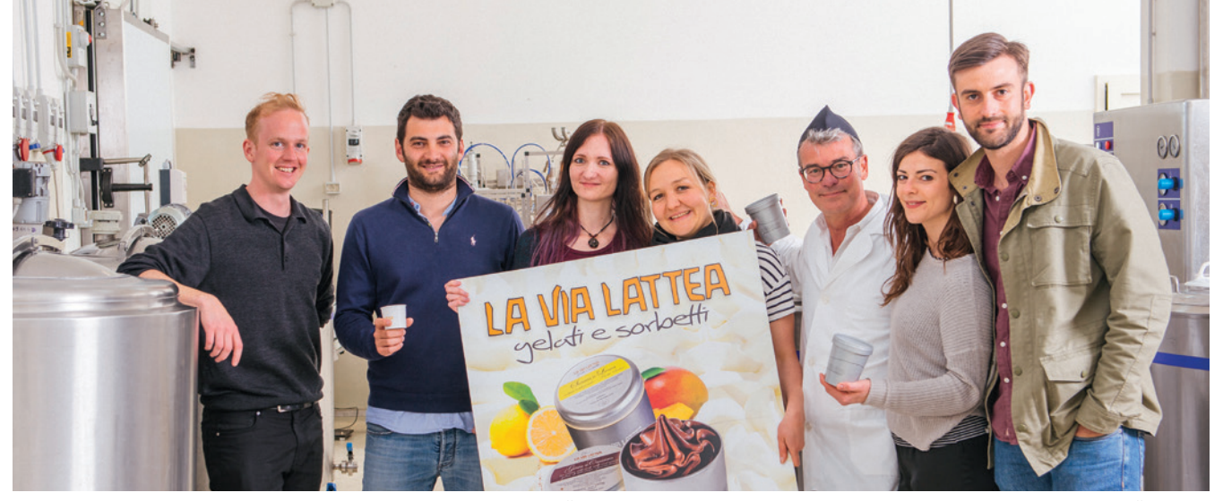
As part of the transparency initiative, two Ökofrost employees visit the ice cream producer La Via Lattea.

Light and shadow: "Organic is not perfect either", says managing director Gerull. "But it is the best alternative to conventionally produced food." Ökofrost attaches great importance to publishing information that is not usually communicated for fear that it could have negative effects. "From our perspective there is no such thing as an 'ideal product'. Everyone has an individual view and evaluates differently. Therefore, we present the reality and the reasons for our product