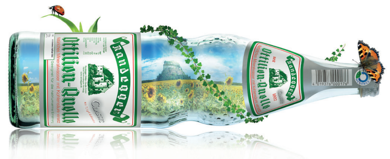
The pearl bottle — a bottle design of fifty years.

Uniformity also benefits bottlers, who have since limited themselves to branding their products purely by labels. Customers and the planet also benefit in that they can hand in their empty bottles for reuse all over Germany. Glass is the only material in the world that can be recycled infinitely.